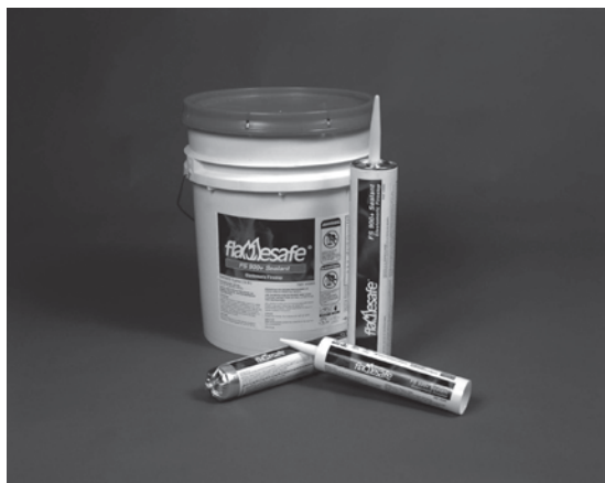
FlameSafe FS 900+ Sealant

FS 900+ can be used in various penetrations and construction/architectural joint configurations. Examples of listed systems include metallic and non-metallic pipes, cable and HVAC penetrations, concrete floor-to-floor, floor-to-wall and wall-to-wall applications, as well as for concrete, CMU and gypsum head of wall applications requiring dynamic joint movement. FS 900+ is a versatile, yet economical solution for a wide range of through-penetration and joint construction conditions.